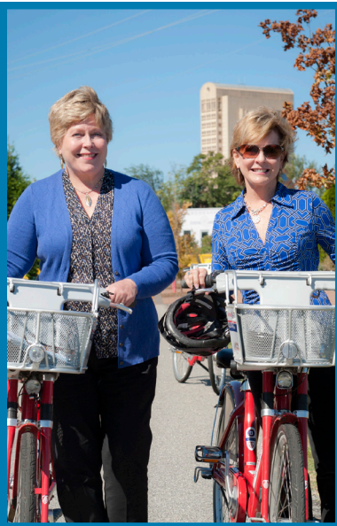
Ruth L. Cate Chair